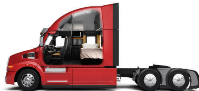
72" Stratosphere High Roof

The ergonomic dash with digital interface features an easy-to-read and customizable layout that gives you the data you need at a glance, with integrated steering wheel controls that let you change vehicle information and entertainment settings without your hands ever leaving the wheel.